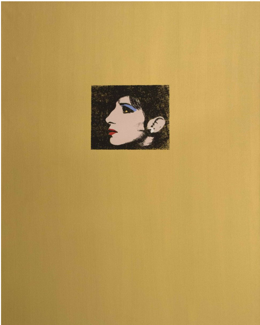
"GOLD BARBRA," 1992

important. It's also why we love Madonna—because she went on [the Late Show with David Letterman ] and said, 'I want to rule the world.' Gertrude [Stein] was a more mature and literary love that came later. My interest was from her portrait by Picasso that I saw at The Met when I was young, but it developed more in my 20s. She was another picture of female, Jewish ambition. She said, 'I am a genius' and she was profoundly centered on it. I had an aspirational identification with these women. I aspired to their ambition, their genius, and how they unapologetically owned these qualities."