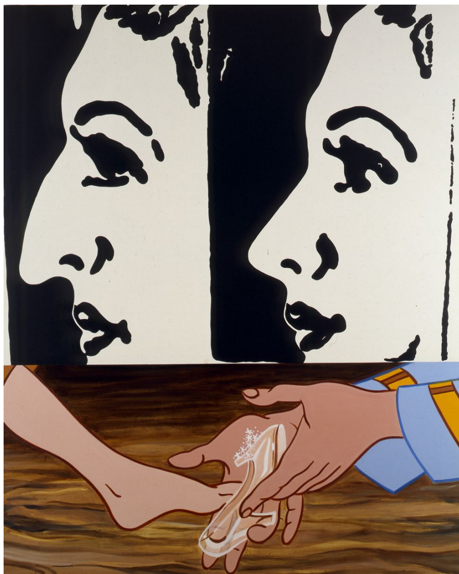
"BEFORE AND HAPPILY EVER AFTER," 1991

"I could never separate those things because I knew I wanted to be an artist at the age of 5. I was looking for examples of creativity that I could relate to and identify with. I could see [Frank] Stella and [Andy] Warhol but their work didn't reflect me. They were like lofty, Apollonian gods. I wanted idols that sounded and felt like me. I wanted to see it so I could become it. After college and learning the canon of great men, it was the height of Second Wave feminism. I saw art that had much more to do with me and my experience. It was amazing to see Elizabeth Murray's work and have it change my life, to see Barbara Kruger's work and have it change my life again, then to show with Sherrie Levine and have that completely change what I thought about art. Those were the inspirations."