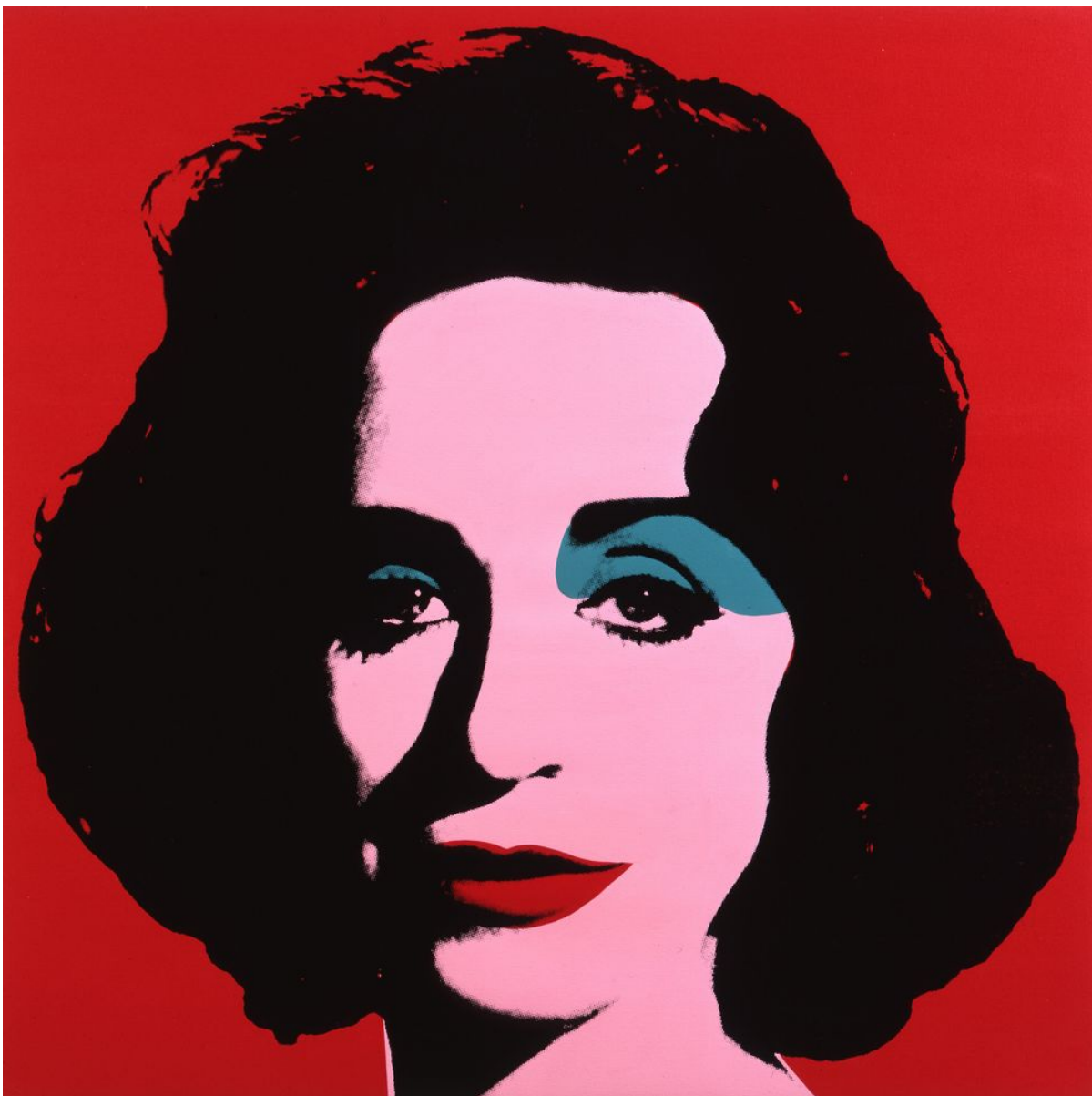
"RED DEB," 2000

The people who actually inspired my work as a conscious artist are Pat Steir, Elizabeth Murray, and Joan Snyder, basically the New York school of painting in the '70s where it intersected with feminism. These artists showed me how to use a language I had learned and make it speak for me. That's what they were doing, so that was my inspiration. It made me the artist I am because what these women did was much more about what I wanted that language to say. Faith Ringgold used materials that were not usually associated with high art, Adrian Piper was operating in conceptual art and philosophy. Barbara Kruger, Sherrie Levine, and Cindy Sherman took a deconstructive approach to power and photography that has also informed what I do."