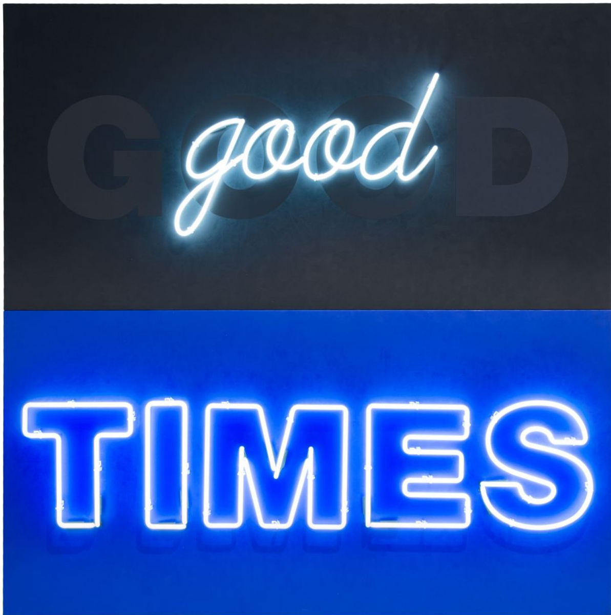
"GOOD TIMES #4," 2016

"I was always interested in post-war painting in New York and looking back on how power and value are established in art in general. I wanted to see from my point of view and think about how I could use that language to reflect my own viewpoint, to talk about something other than the assumed value and the benefit of the doubt that was always given to white men. I have said it before but it is really the best explanation of it—I used art history as a readymade and made it speak for me. Post-war American painting was my first love, it was what I saw at MoMA when I was 16. I am always very loyal and grateful to my first loves."