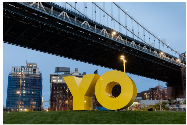
PHOTO BY ETIENNE FROSSARD. PHOTO COURTESY OF KAVI GUPTA GALLERY. ARTIST RIGHT SOCIETY/ARS

PHOTO BY ETIENNE FROSSARD. PHOTO COURTESY OF KAVI GUPTA GALLERY. ARTIST RIGHT SOCIETY/ARS.